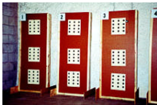
10-meter air rifle range target holders with targets placed at the proper heights for firing from the prone, kneeling, and standing positions.

To understand these safety rules it is first necessary to know something about how target ranges are designed. Study the diagram of the range so that you understand how the firing points and targets are positioned on a typical range. This diagram is for a six-point range, but target ranges can have as few as four and as many as 100 or more firing points.